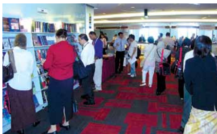
WASPaLM 2007 (Exhibition Area)